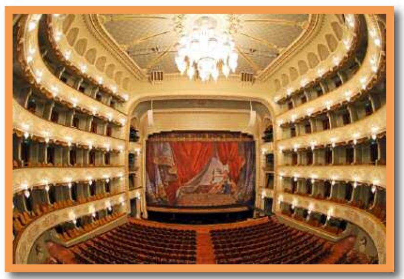
Tbilisi Philharmonic Concert Hall

Click here for more information and to register.