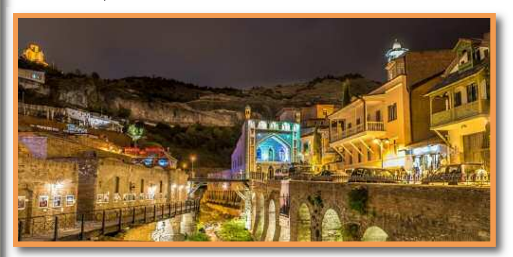
WCF X - Topics and Speakers

Among the crucial topics to be discussed at World Congress of Families X are: