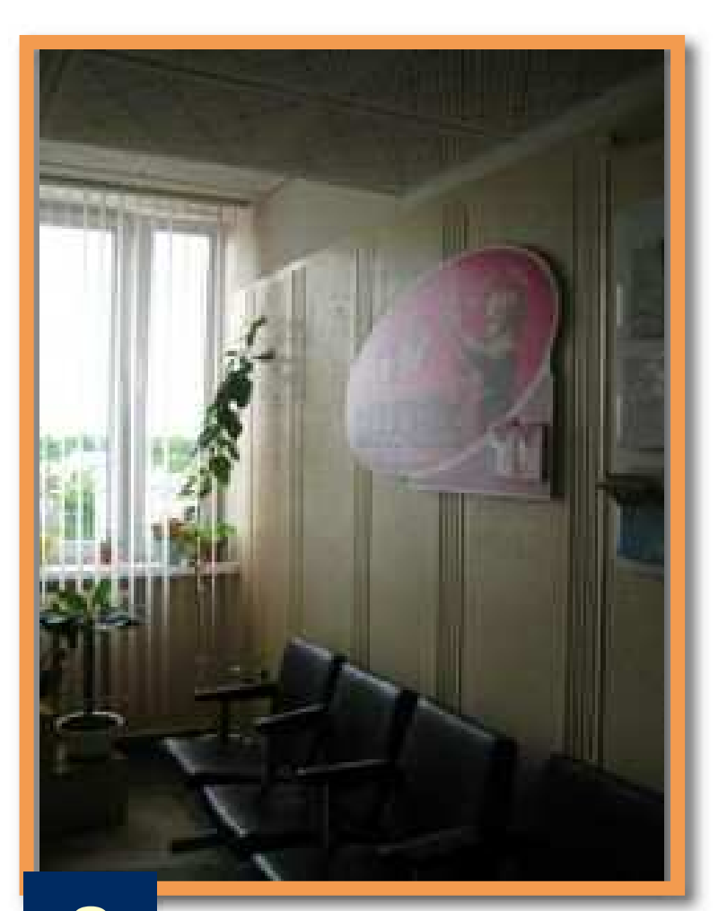
Pro-life exhibits promoting "Weeks Without Abortion" Initiative in Belarus

With an estimated 27,000 abortions committed in Belarus in 2012, the initiative dovetails well with legislative changes enacted to restrict abortion in 2013. The restrictions include limiting late termination of pregnancies fo